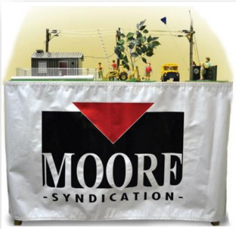
Power Town 4ft. by Moore Syndication