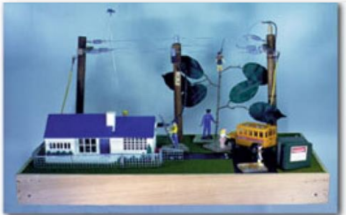
Electric University