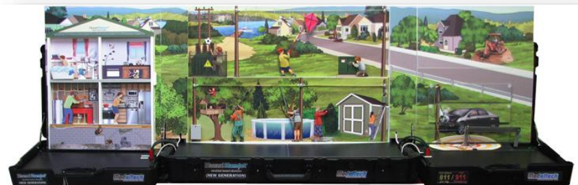
Hazard Hamlet by Modeltech