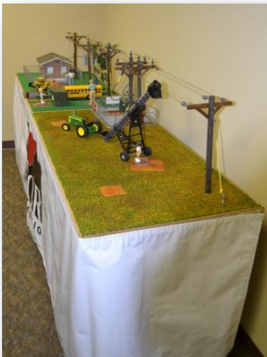
Power Town 8ft. by Moore Syndication