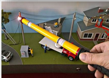
High Voltage Hazard Display and Arc Generating Hot Stick by HiTech Safety Displays Ltd.