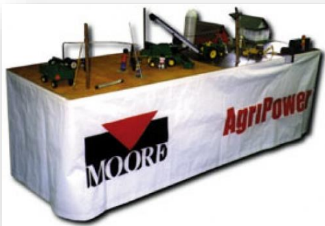
AgriPower by Moore Syndication