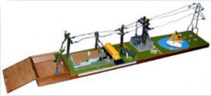
Little House of Hazards by Moore Syndication